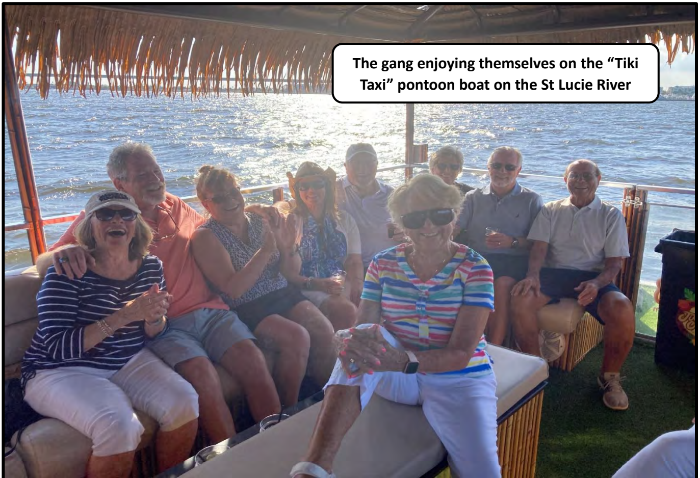
The gang enjoying themselves on the "Tiki Taxi" pontoon boat on the St Lucie River