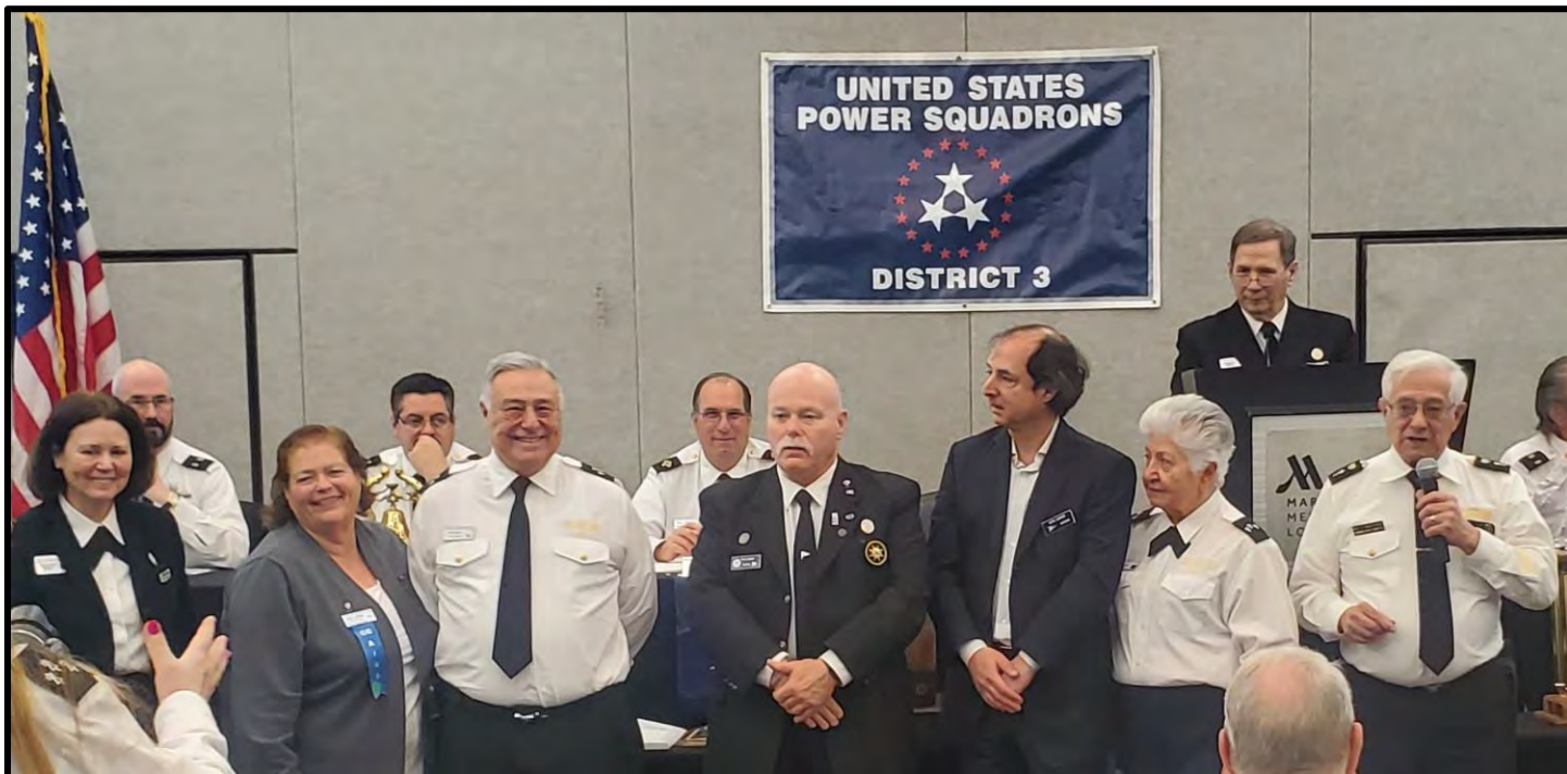
Captree took second place for the Distinctive Communicator Award for its “Captree LOG” publication.