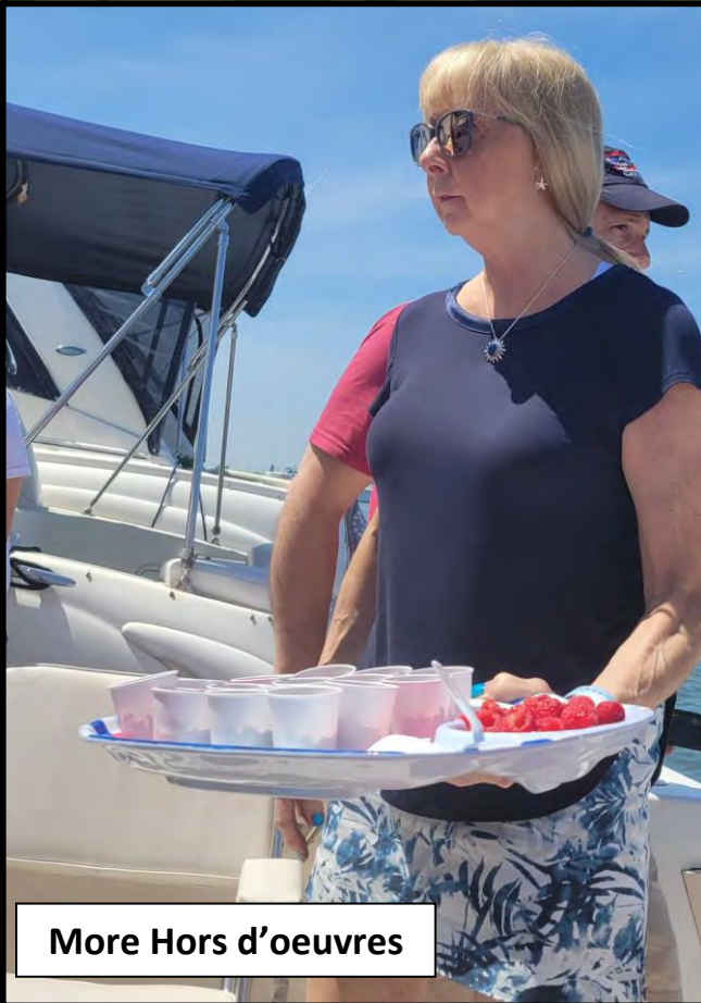
More Hors d'oeuvres