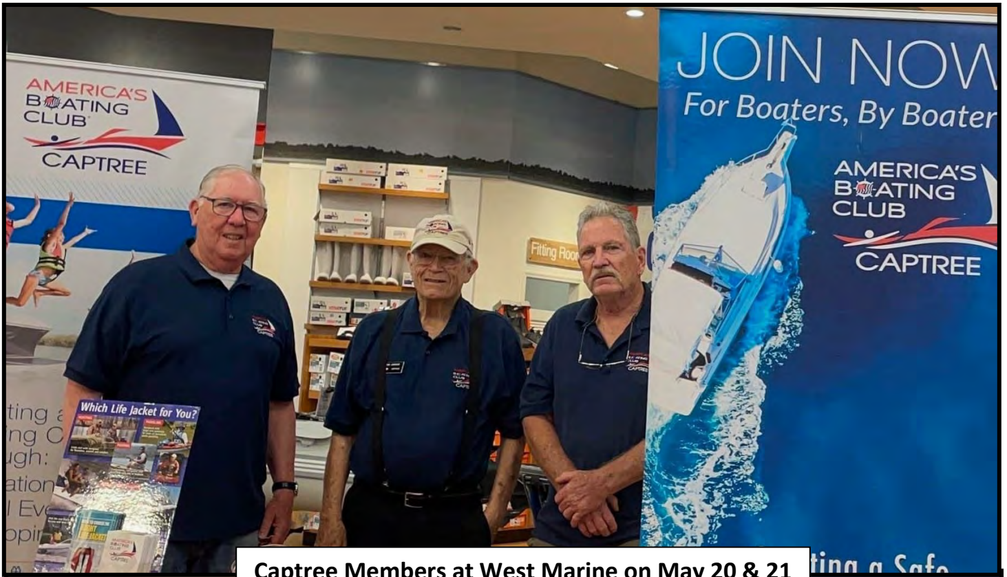
Captree Members at West Marine on May 20 & 21 promoting the benefits of joining USPS