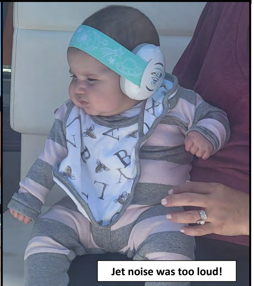
Jet noise was too loud!